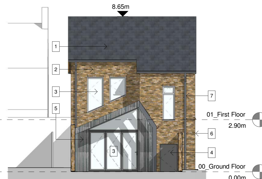
House 2 Elevation 4 1 : 100